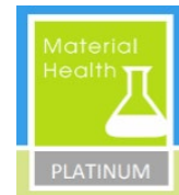
MAS Certified Green®

In fact, we were the first adhesives manufacturer to obtain the highest level of Material Health Certificate from Cradle to Cradle, a globally recognized standard for products that are safe, circular and responsibly made, and we maintain that position today.